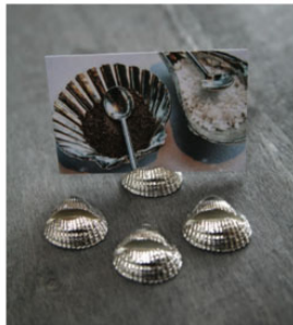
Shell Place Card Holders