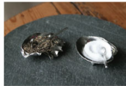
Clam and Oyster Set