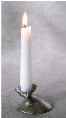
Coastal Candle Holder