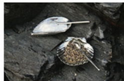
Cornwall Salt and Pepper Set